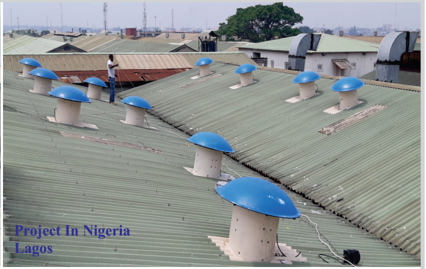
Project In Nigeria Lagos